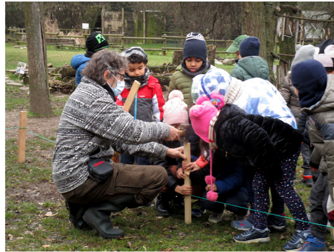
I have the courage to hold the post!