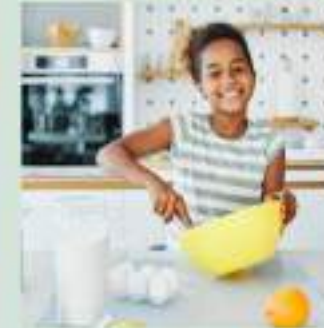
JUNIOR CHEFS: COOKING, CULTURE AND NUTRITION