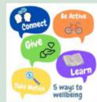
THE PATH TO WELL-BEING