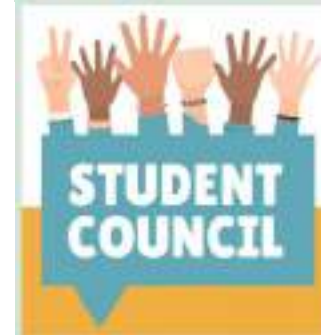
LEADERSHIP AND COMMUNITY ACTIVISM: STUDENT COUNCIL