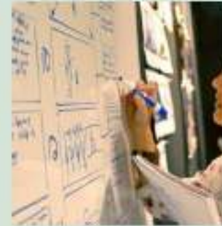
CREATIVE WRITING FOR BEGINNERS: BRINGING YOUR STORY TO LIFE