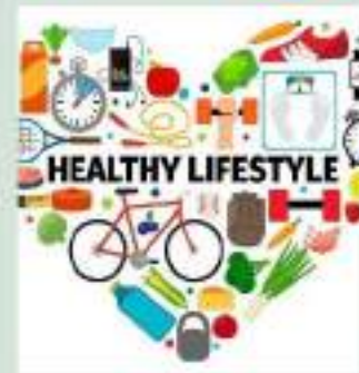
HEALTH HEROES: HEALTH WEEK PLANNING COMMUNITY